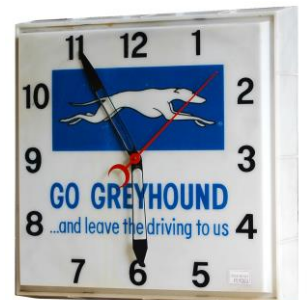
LIGHT UP CLOCK GREYHOUND 2233-03-01 ¥59,000 H380 W380 D75