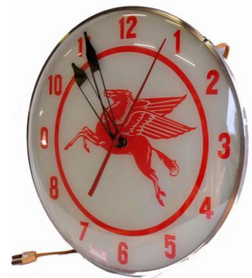
LIGHT UP CLOCK 2876-12-06 ¥98,000 Ø380 D100