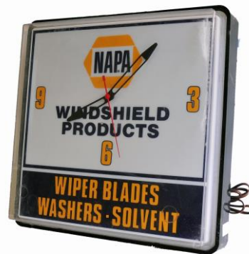
LIGHT UP CLOCK 2876-12-03 ¥34,000 H410 W410 D130