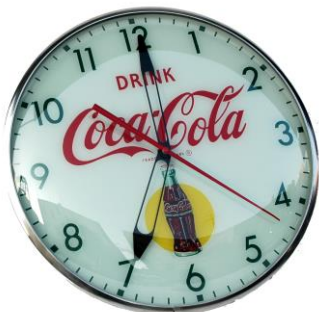
LIGHT UP CLOCK COCACOLA 2173-01-01 ¥59,000 H370 W370 D100