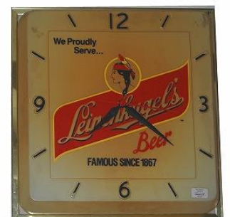
1923-08-01 LEINENKUGEL ¥68,000