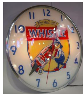
LIGHT UP CLOCK WHISTLE 2173-01-01 ¥59,000 H370 W370 D100