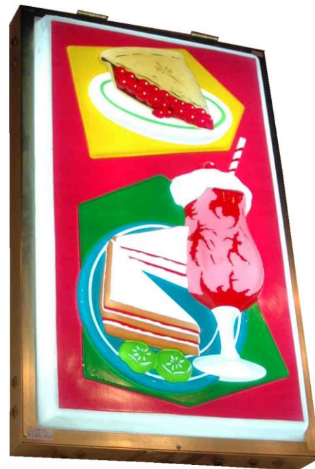
SODA FOUNTAIN LIGHT UP SIGN 1960'S 3619-21-01 ¥240.000