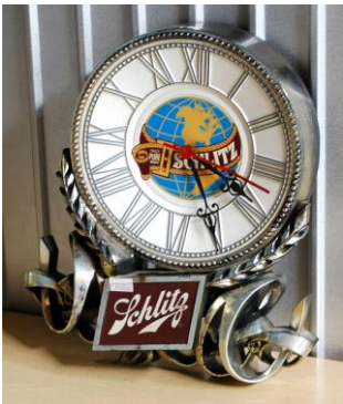
LIGHT UP CLOCK SCHLITZ 3619-02-02 ¥42.000 H435 W420 D90