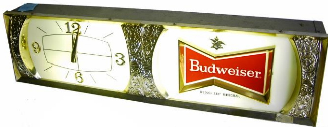
BUDWEISER LIGHT UP CLOCK 1858-11-2 ¥59.000 W800