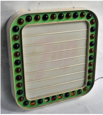
7UP LIGHT UP SIGN 3487-06-01 ¥49,000 H580 W555 D90