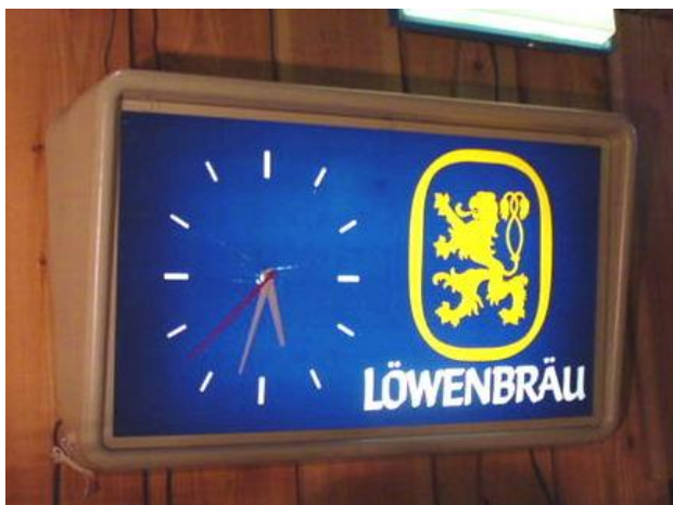
Lowenbrau Light up Clock 3619-02-17 H450 W770 D210 ¥42,000