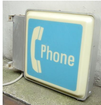
PHONE SIGN 1861-7 ¥78.000 W670 H550 D135