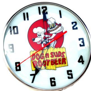
LIGHT UP CLOCK DOGN SUDS 2173-01-01 ¥59,000 H370 W370 D100