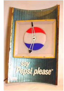
PEPSI LIGHT UP SIGN 3619-02-02 ¥49,000 H405 W265 D100