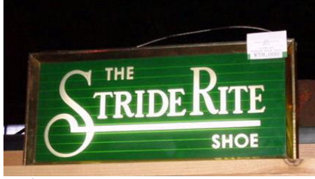
Stride Rite 1176-33 ¥78,000 H230 W510 D70