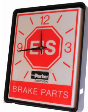
LIGHT UP CLOCK 2876-12-02 ¥29,000 H430 W360 D80