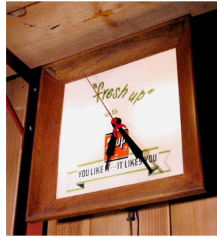
LIGHT UP CLOCK 7UP 1177-4 ¥60,000 H410 W410 D115