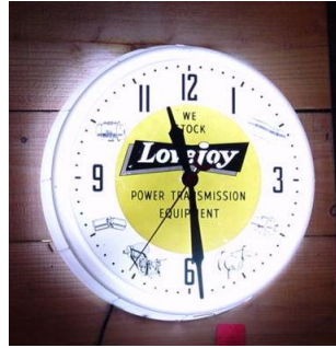
LIGHT UP CLOCK LOVEJOY 3619-20-01 ¥34.000 H400 W400 D120