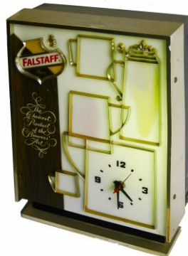
Falstaff Clock 3619-02-13 ¥42.000 W220H290D90