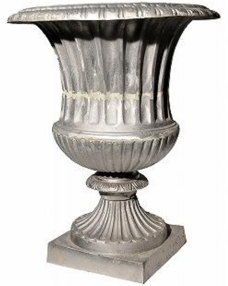
URN, CAST ALUMINIUM 2936-01-01 ¥48,000 H650 W540