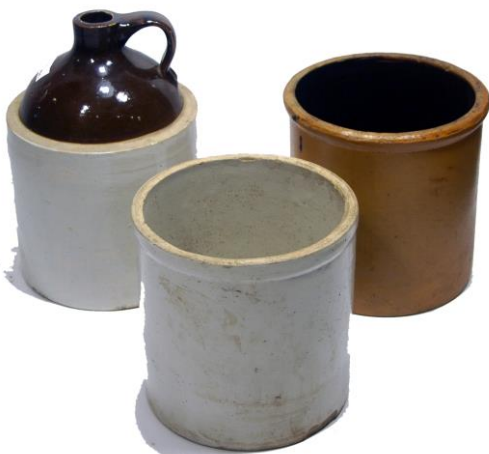
L 2646-02-01 ¥14.000 H270 Φ185 M 2646-01-01 ¥14.000 H190 Φ190 R 2646-01-01 ¥14.000 H190 Φ190