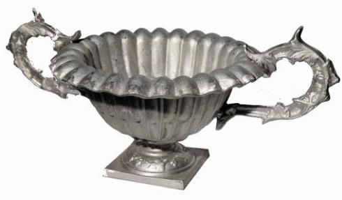
URN, CAST ALUMINIUM 2936-02-01 ¥29,000 WHITE×1 BLACK×1 H320 W710 D440