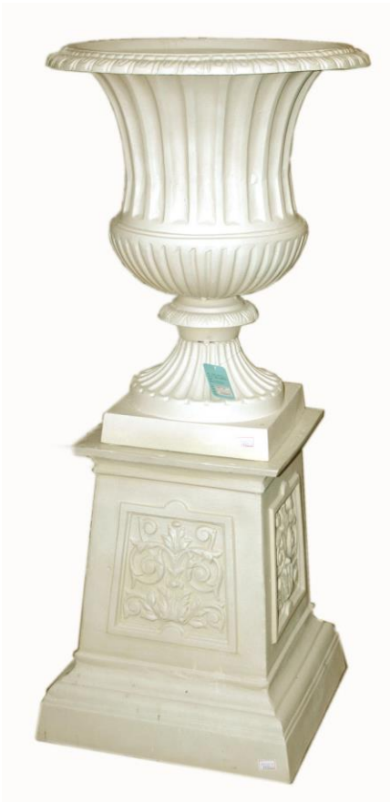
URN 2936-01-01 ¥98,000 H1200 W540 D540