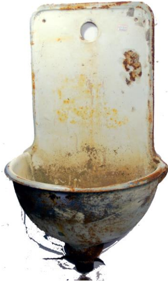
IRON RECEPTACLE 2679-16-01 ¥64.000 H730 W450 D275