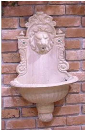
LAVABO, CAST ALUMINIUM