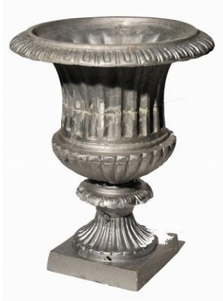
URN, CAST ALUMINIUM 2936-03-01 ¥24,000 ×4 H360 W300