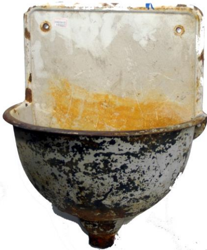
IRON RECEPTACLE 2682-04-01 ¥64.000 H475 WW390 D240