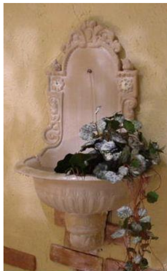
LAVABO, CAST ALUMINIUM 1608-03 ¥74.000