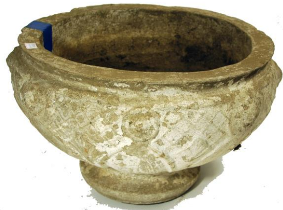
CAST STONE URN 2679-17-01 ¥45.000 x1 H285 Φ470