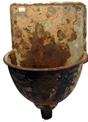
IRON RECEPTACLE 262-04-01 ¥64.000 H550 W380 D260