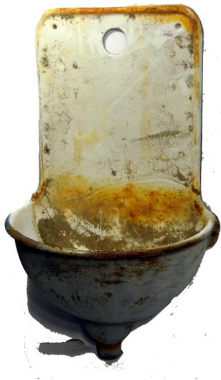
IRON RECEPTACLE 2679-16-01 ¥64.000 H730 W450 D275